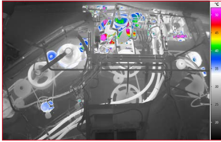
Optimisation of drive assemblies