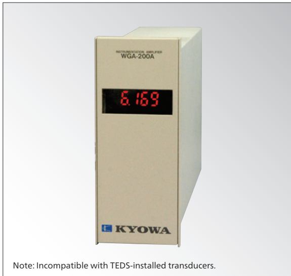
Note: Incompatible with TEDS-installed transducers.