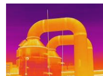
Oil and Petrochemical