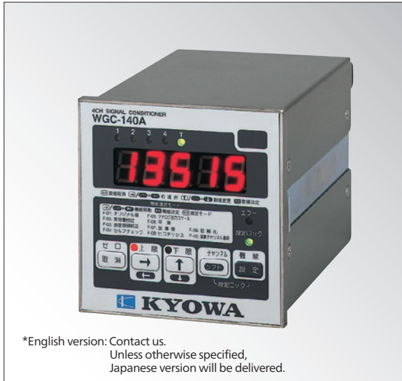
*English version: Contact us. Unless otherwise specified, Japanese version will be delivered.